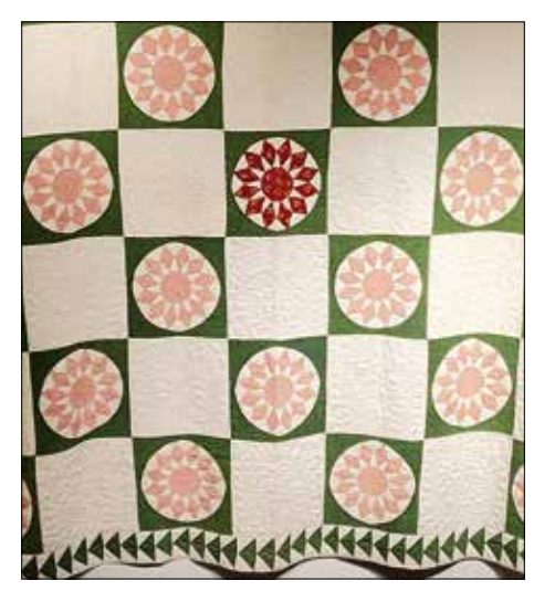
A patchwork pattern quilt featured in the exhibit.

The quilts, dating from the 1840s to the 1940s, feature styles such as North Carolina Lilly, Dresden Plate, Friendship, Six-Point Star, Princess Plume, Patchwork, Patriotic, Loa Cabin, Flower Basket, Postage Stamp, and Crazy Quilt.