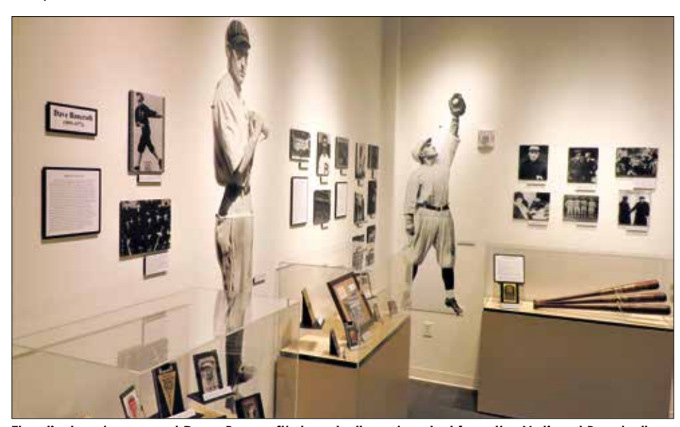
The display showcased Dave Bancroft's baseball cards, a bat from the National Baseball Hall of Fame, and photographs from throughout his career.

Later that evening, the Sioux City Explorers dedicate the Dave Bancroft Pavilion featuring a new plaque honoring the city's premier shortstop. The pavilion is located behind the new Explorer's business office.